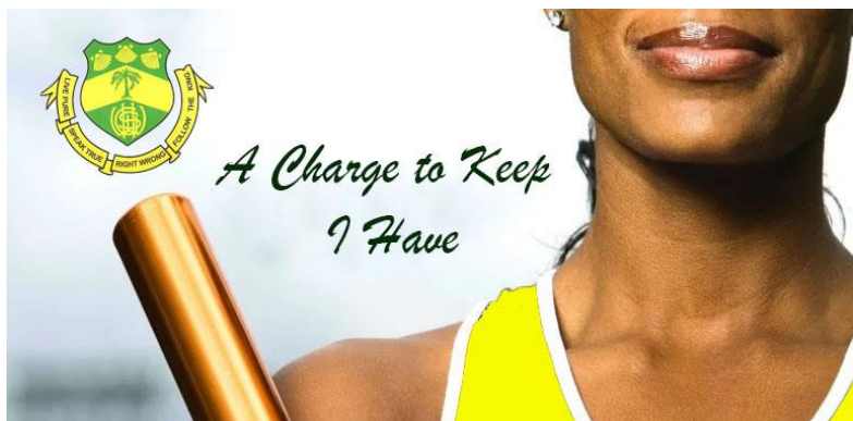
Handing over of the 25 th Anniversary fundraising dinner dance baton to the 1997 Year Group from the 1996 Year Group

Saturday May 28 th , 2022, 10.00am 25 th Anniversary Fundraising Dinner Dance Baton Change. Neonatal Intensive Care Unit. Central Regional Hospital.