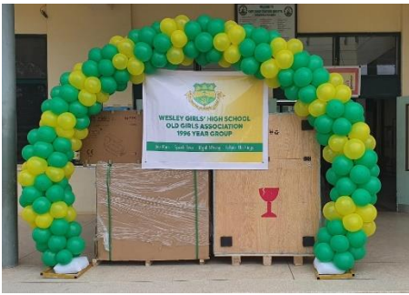
Presentation to the Neo-natal Intensive Care Unit of the Cape Coast Teaching Hospital. 28 th May 2022

None-the-less, the 1995 Year Group persevered and in commemoration of their 25 th Anniversary, presented the first ever Hemodialysis Machine to the Pediatric Ward of the Korle Bu Teaching Hospital.