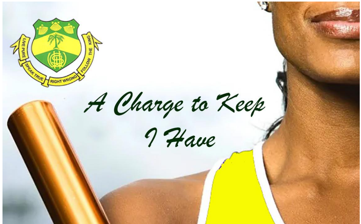
Live Pure, Speak True, Right Wrong, Follow the KING